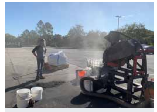
Simulant tech crushing lava rock with hammer mill

The Exolith Lab is also an active ISRU research center, with multiple projects always going on. For example, one of the postdocs, Hannah Sargeant, is working on molten regolith electrolysis. They also have plant growth research underway with their different simulants and mineral mixes to see how they affect plant growth. While their primary operation is selling simulant, they also operate in the academic and research sphere, making scientific studies of regolith properties, putting out papers and participating in conferences as well. The Exolith Lab also allows external researchers to contract to use their regolith bins for research into areas such as dust mitigation, mobility, regolith operations and they hope to see a rover tested in their lab someday. To that end they're currently working on a 10m x 10m x 1m "open source" regolith bin with gravitational offloading capabilities that will be available to use to the commercial sector. It's currently planned for opening in the fall.